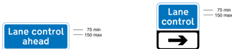
5012 System of lane control light signals ahead