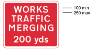
7307 Exit from a works site ahead