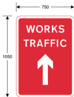
7303 Direction to be taken by road works or construction traffic at a junction ahead