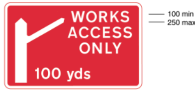
7306 Direction to be taken by road works or construction traffic to an access to a works site ahead