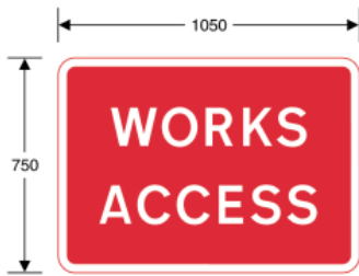
7301 Temporary access to a construction or road works site