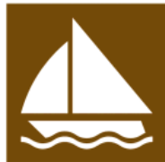
T104 Water sport activities