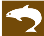
T126 Aquarium or oceanarium