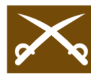
T154 Battlefield site