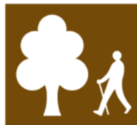
T144 Woodland walk in a deciduous or mixed forest