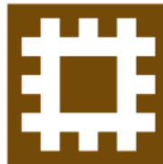
T202 Property in the care of English Heritage