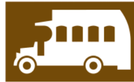
T162 Bus museum