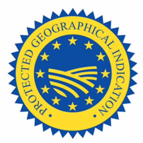
10 % magenta 90 % yellow