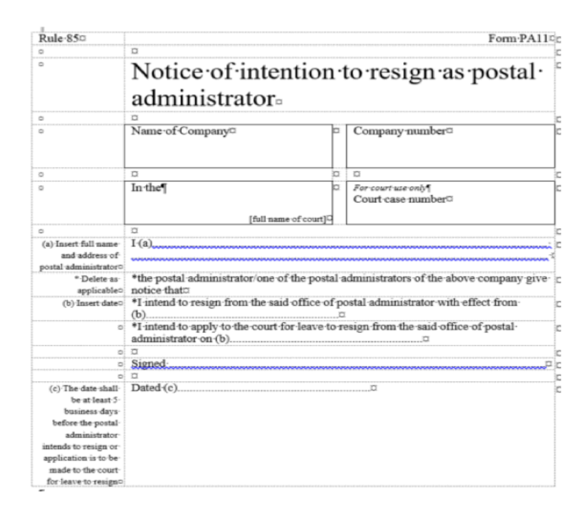
SCHEDULE 2 Rule 150