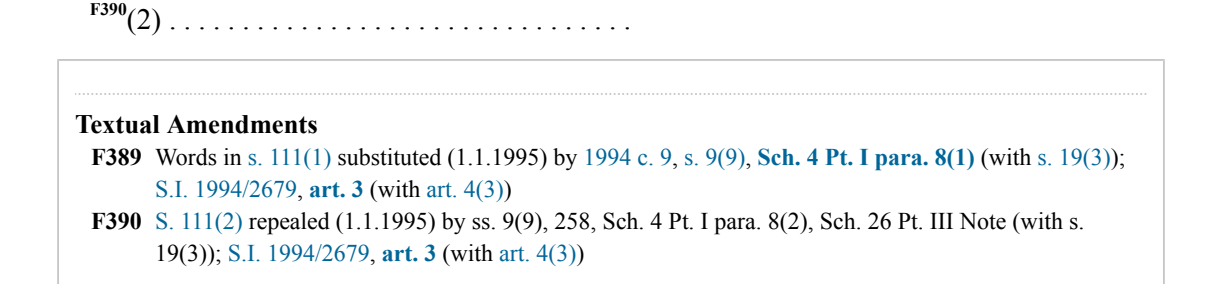
General provisions as to revenue traders

(1) If any person uses for any purpose of his trade any premises or article required by or under the revenue trade provisions of the customs and excise Acts to be entered for that purpose without entry having been duly made thereof, [F389] his use of the premises or article shall attract a penalty under section 9 of the Finance Act 1994 (civil penalties), and any such article and any goods found on any such premises or in any such article shall be liable to forfeiture.