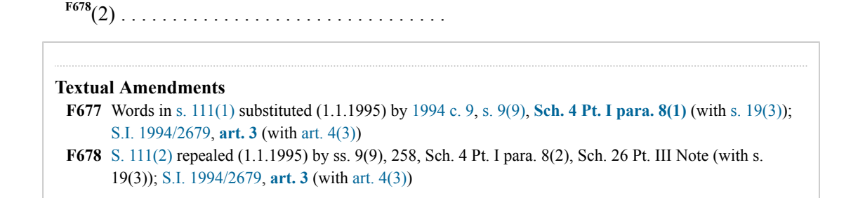
General provisions as to revenue traders

(1) If any person uses for any purpose of his trade any premises or article required by or under the revenue trade provisions of the customs and excise Acts to be entered for that purpose without entry having been duly made thereof, [F677] his use of the premises or article shall attract a penalty under section 9 of the Finance Act 1994 (civil penalties), and any such article and any goods found on any such premises or in any such article shall be liable to forfeiture.