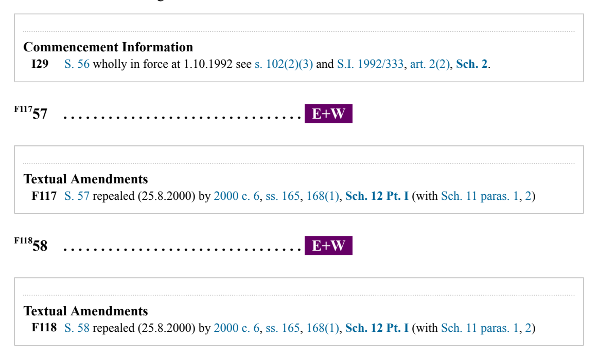
Detention etc. pending trial

In this subsection "local authority" and "parental responsibility" have the same meanings as in the Children Act 1989."