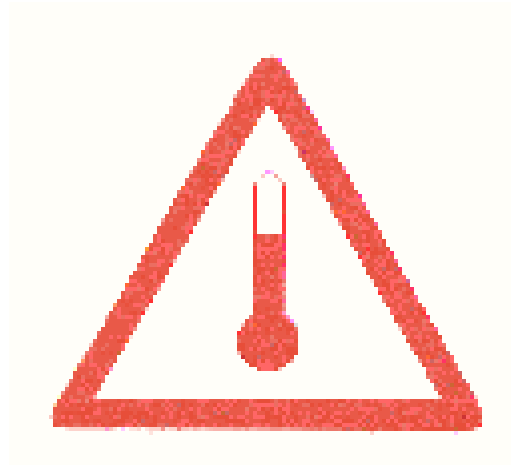
Figure 6 Elevated temperature substances

The background colour of the sign shall be white, and the colour of the border and the thermometer symbol shall be red.”