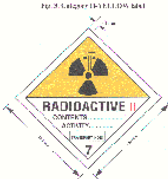
Fig. 3. Category II-YELLOW label Fig. 3. Category II-YELLOW label

The background colour of the label shall be white, the colour of the trefoil and the printing shall be black, and the colour of the category bar shall be red.