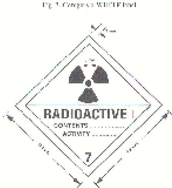
“Fig. 2. Category I-WHITE label Fig. 2. Category I-WHITE label

The background colour of the label shall be white, the colour of the trefoil and the printing shall be black, and the colour of the category bar shall be red.