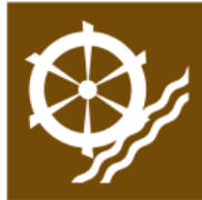
T125 Watermill of historic or architectural interest