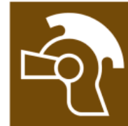
T127 Site with Roman remains