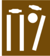
T137 Cricket ground