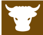
T152 Centre approved by the Rare Breeds Survival Trust