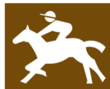
T135 Race course