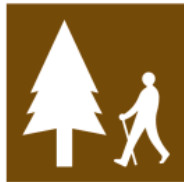
T143 Woodland walk in a coniferous forest