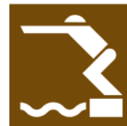
T160 Swimming pool or indoor water sports centre