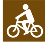
T142 Cycle hire