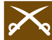
T154 Battlefield site