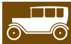
T129 Motor museum