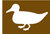
T115 Nature reserve