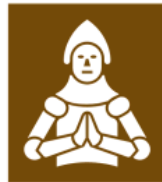
T155 Brass rubbing centre