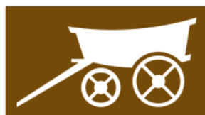
T110 Agricultural museum