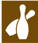
T149 Ten pin bowling