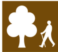
T144 Woodland walk in a deciduous or mixed forest