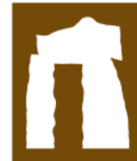
T121 Prehistoric site or monument