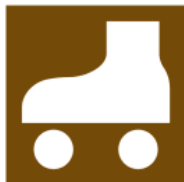
T146 Roller skating