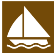
T104 Water sport activities