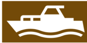
T141 Boat hire