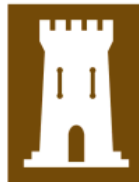
T156 Tower or folly of historic or architectural interest