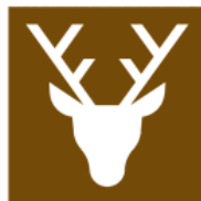
T107 Wildlife park