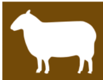
T119 Farm park