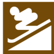
T148 Ski slope