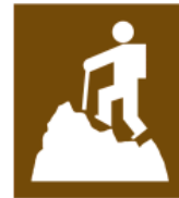
T145 Outdoor pursuits centre