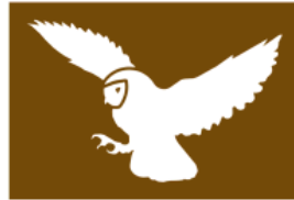
T150 Birds of prey centre