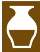
T120 Pottery or craft centre