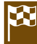
T136 Motor sport