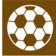
T138 Football ground