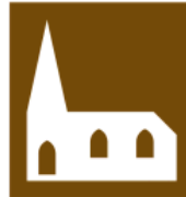
T105 Church of historic or architectural interest