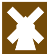
T108 Windmill of historic or architectural interest