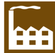
T124 Industrial heritage museum or attraction