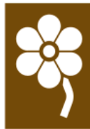
T102 Flower garden or horticultural exhibition