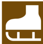
T147 Ice skating