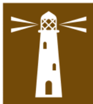
T158 Lighthouse open to the public