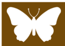
T122 Butterfly farm