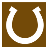
T111 Equestrian centre