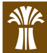
T132 Farm trail