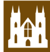
T106 Cathedral of historic or architectural interest