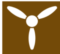
T117 Air museum