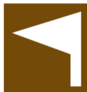
T134 Golf course