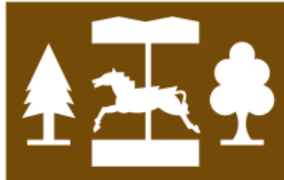
T114 Pleasure or theme park (Both trees may be of the same type, and either or both trees may be omitted)