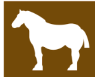
T128 Heavy horse centre