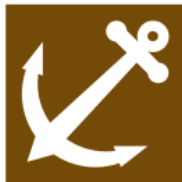
T116 Historic dockyard or attraction of maritime interest