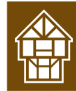
T157 Historic building