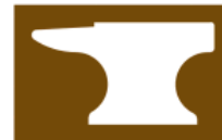
T130 Craft centre or forge