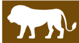
T153 Safari park