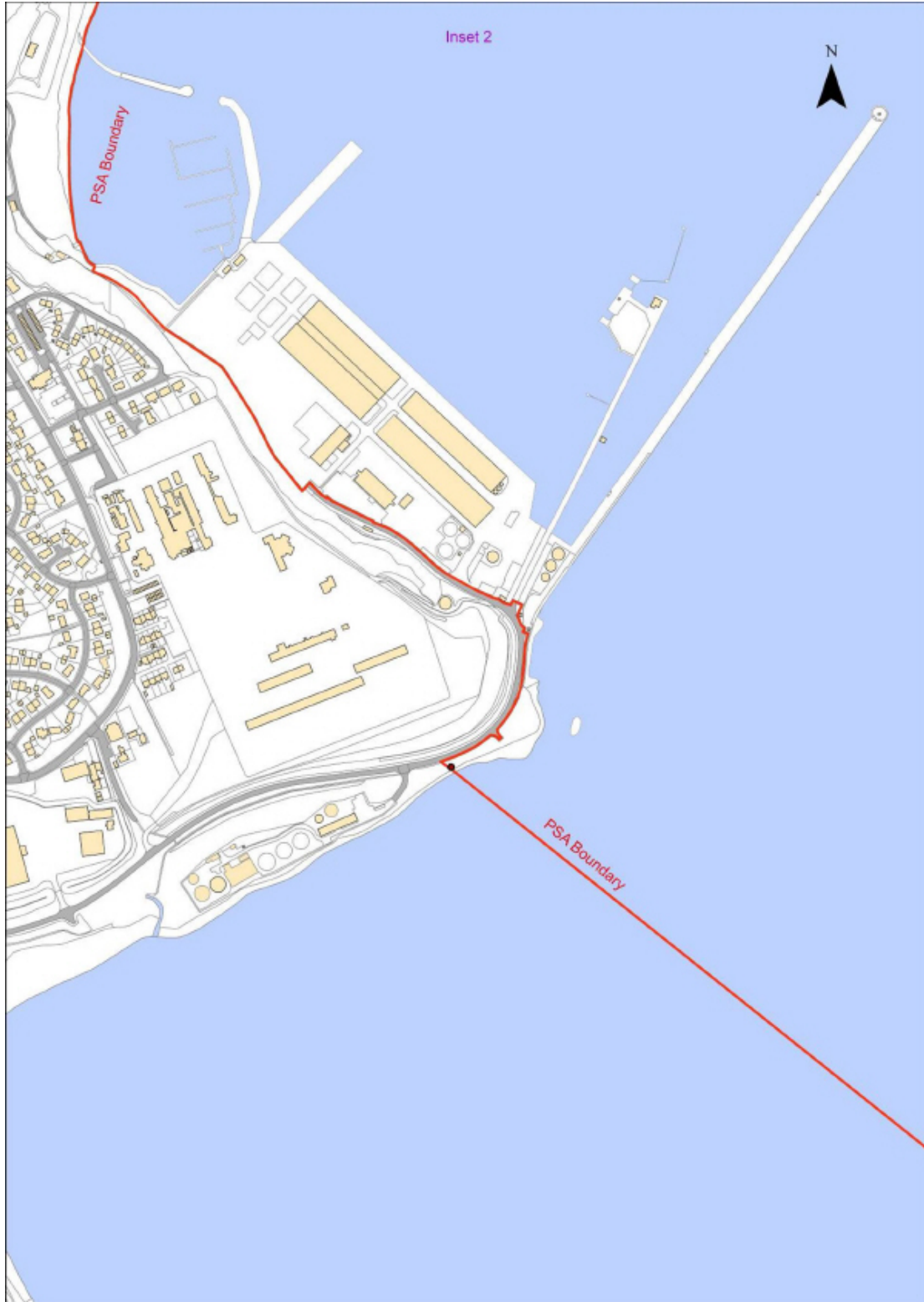
Inset Plan 2

Changes to legislation: There are currently no known outstanding effects for the The Port Security (Port of Peterhead) Designation Order 2013. (See end of Document for details)