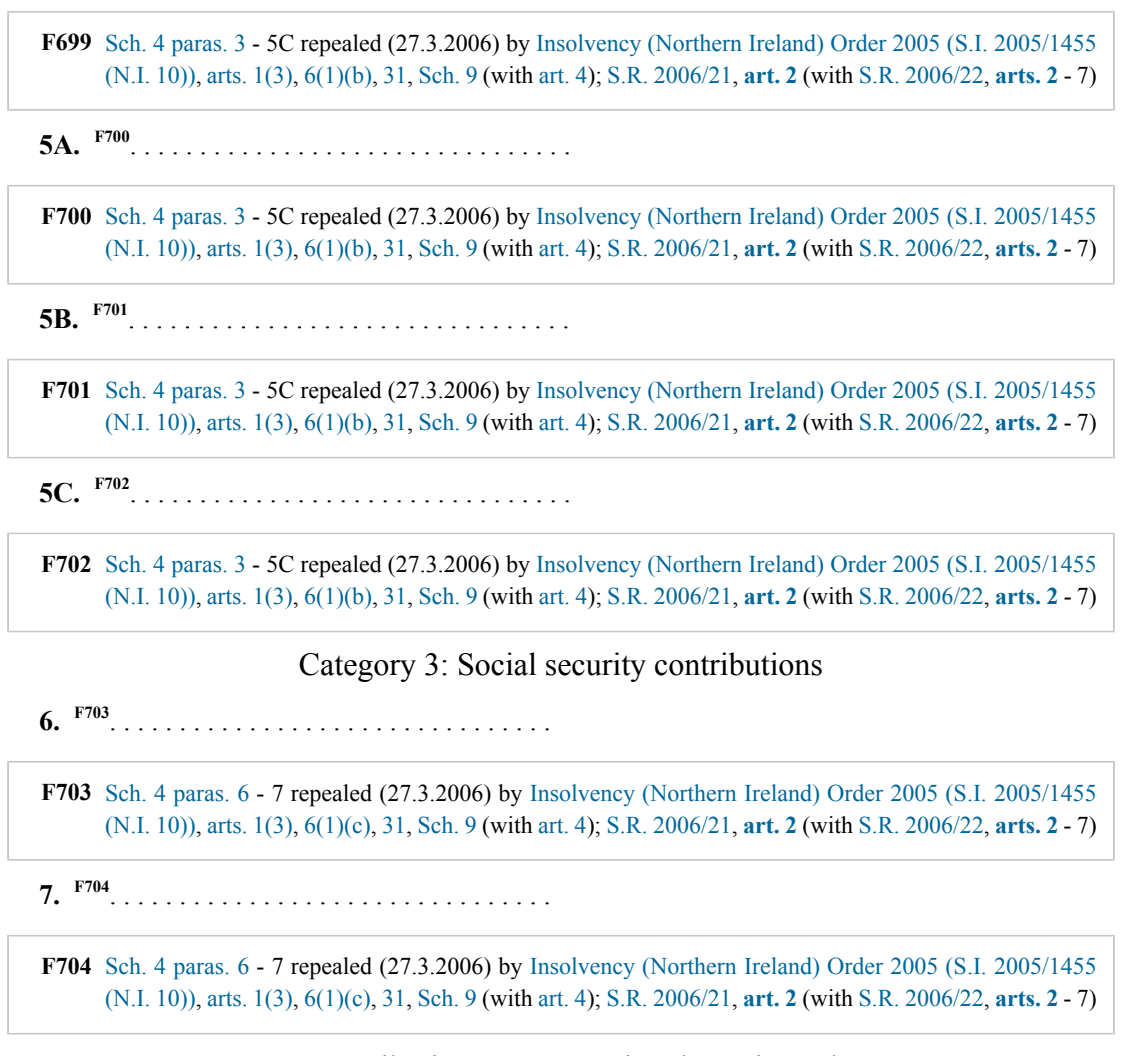
Category 4: Contributions to occupational pension schemes, etc.

Status: Point in time view as at 01/06/2015. This version of this Order contains provisions that are prospective. Changes to legislation: The Insolvency (Northern Ireland) Order 1989 is up to date with all changes known to be in force on or before 18 June 2024. There are changes that may be brought into force at a future date. Changes that have been made appear in the content and are referenced with annotations. (See end of Document for details)