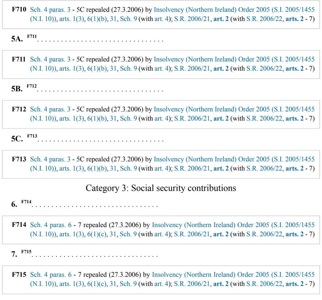
Category 4: Contributions to occupational pension schemes, etc.

Status: Point in time view as at 17/02/2016. This version of this Order contains provisions that are prospective. Changes to legislation: The Insolvency (Northern Ireland) Order 1989 is up to date with all changes known to be in force on or before 05 July 2024. There are changes that may be brought into force at a future date. Changes that have been made appear in the content and are referenced with annotations. (See end of Document for details)