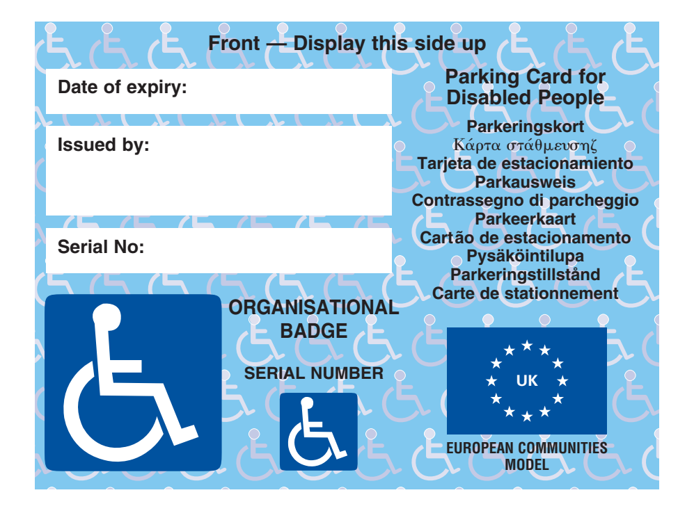
DIAGRAM 2 FORM OF BADGE FOR A SUPPORT ORGANISATION