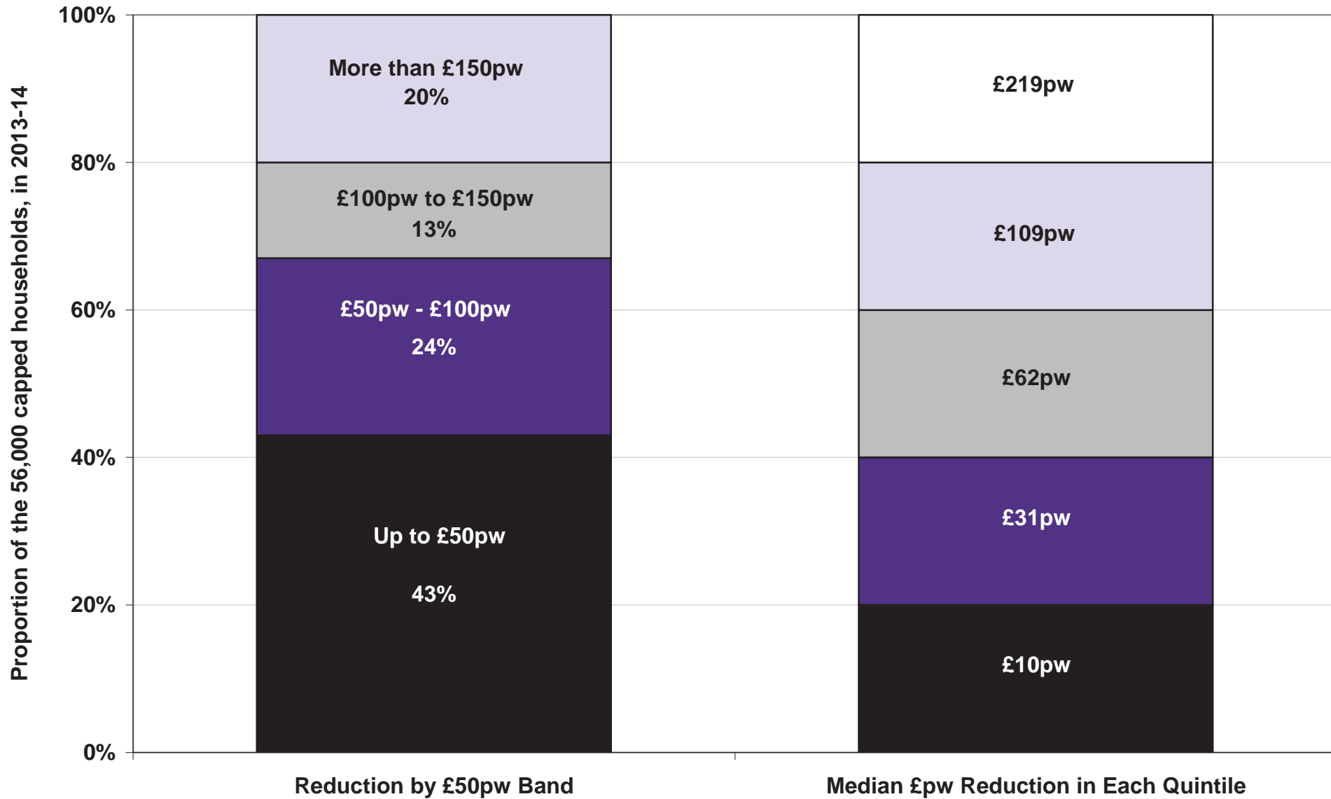
Chart 2: Averages of amounts of benefit reduced for households affected by the policy 5