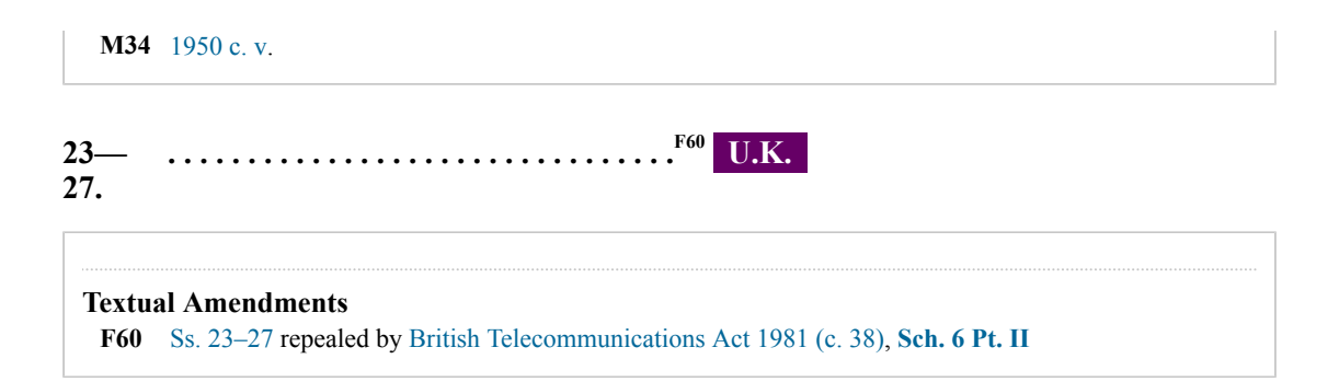
Charges and other Terms and Conditions applicable to Services

Changes to legislation: Post Office Act 1969 is up to date with all changes known to be in force on or before 03 July 2024. There are changes that may be brought into force at a future date. Changes that have been made appear in the content and are referenced with annotations. (See end of Document for details)