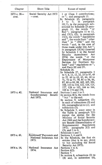
Schedule 1 Schedule 1