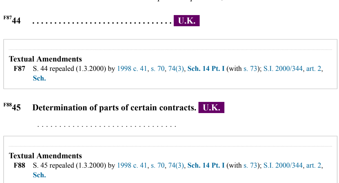
Licences of right and compulsory licences