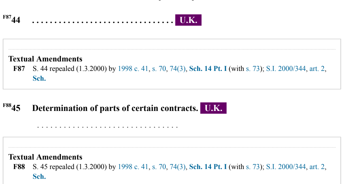
Licences of right and compulsory licences