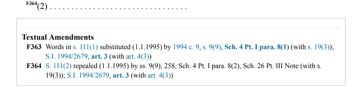
General provisions as to revenue traders