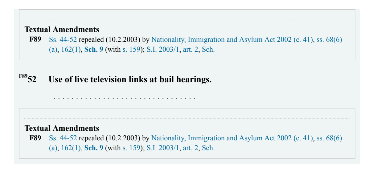
Bail hearings under other enactments

Status: Point in time view as at 16/04/2015. This version of this Act contains provisions that are prospective. Changes to legislation: Immigration and Asylum Act 1999 is up to date with all changes known to be in force on or before 07 September 2024. There are changes that may be brought into force at a future date. Changes that have been made appear in the content and are referenced with annotations. (See end of Document for details)