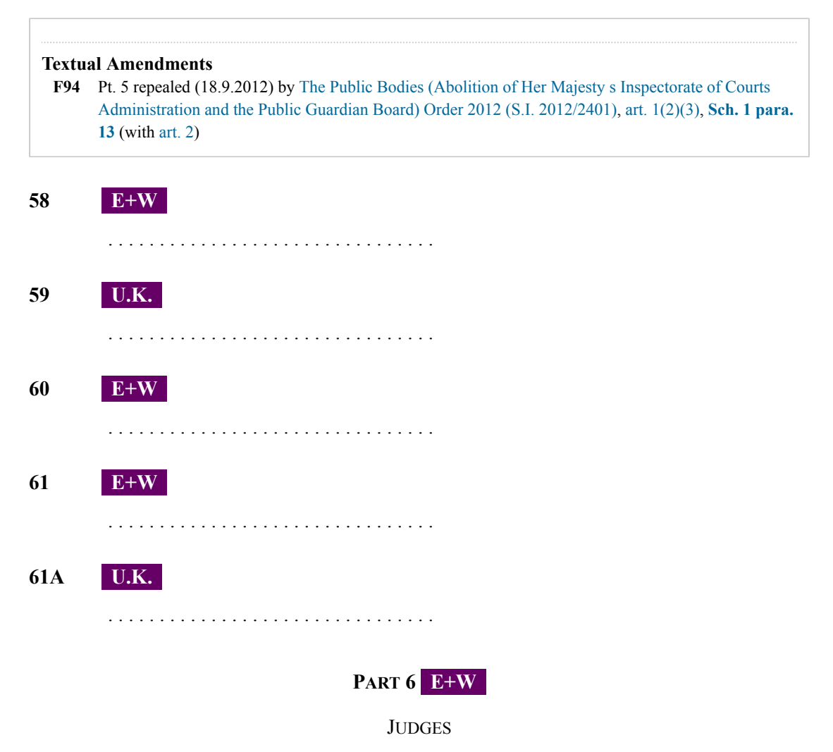
Offices, titles, styles etc.