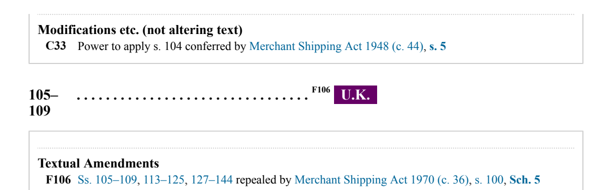
Licences to supply Seamen

Status: Point in time view as at 21/03/1994. This version of this Act contains provisions that are not valid for this point in time. Changes to legislation: There are currently no known outstanding effects for the Merchant Shipping Act 1894. (See end of Document for details)