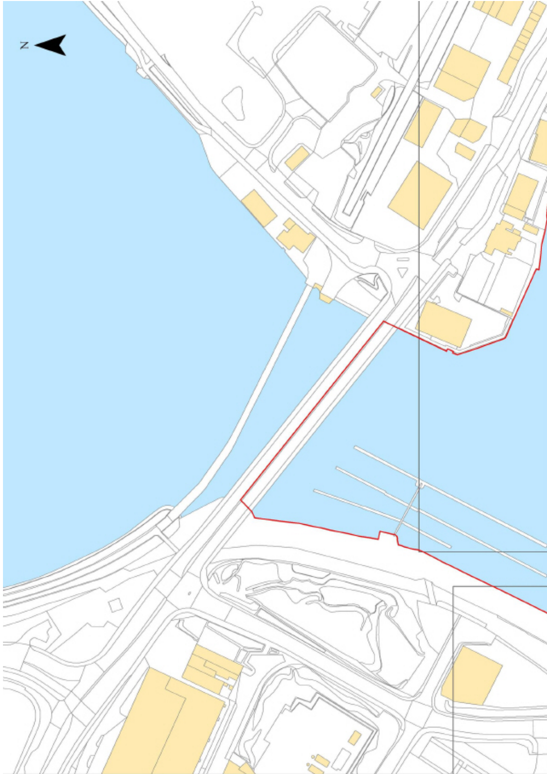
Inset Plan 6

Changes to legislation: There are currently no known outstanding effects for the The Port Security (Port of Plymouth) Designation Order 2014. (See end of Document for details)