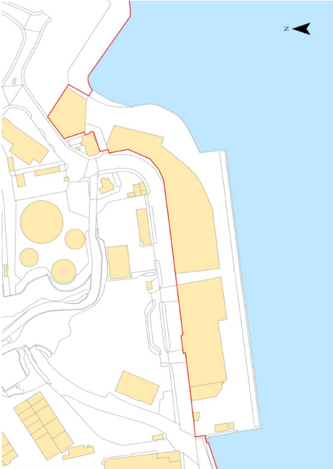
Inset Plan 3

Status: Point in time view as at 14/02/2014. Changes to legislation: There are currently no known outstanding effects for the The Port Security (Port of Plymouth) Designation Order 2014. (See end of Document for details)