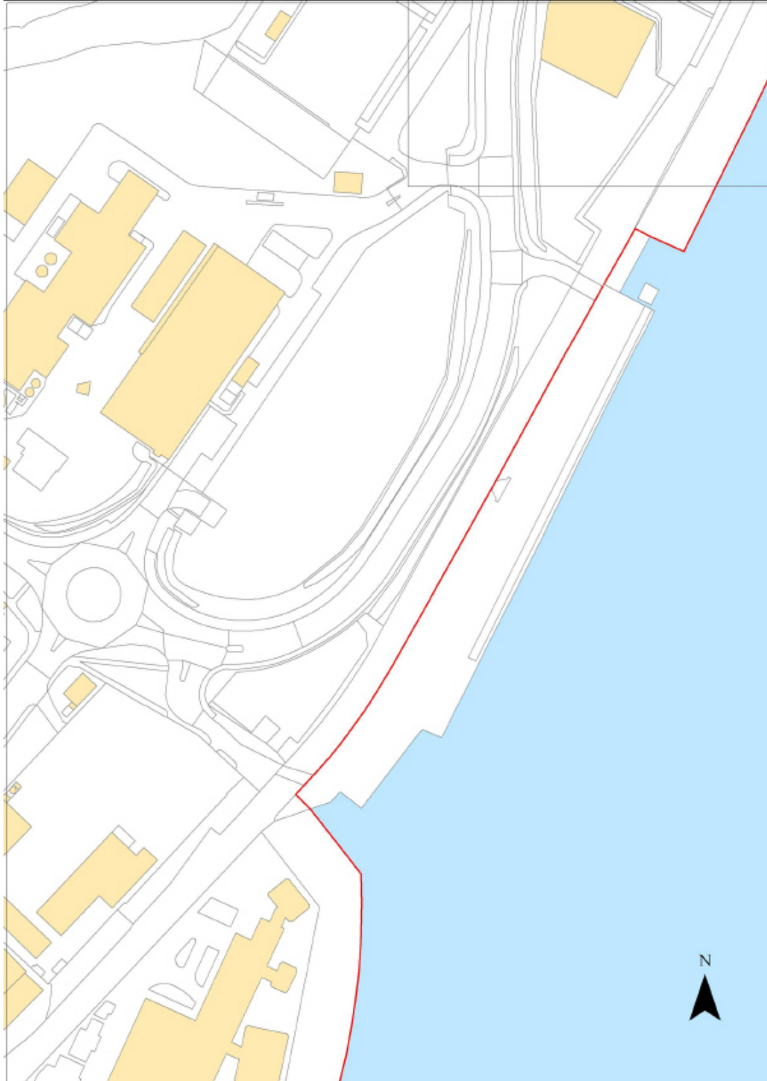
Inset Plan 4

Changes to legislation: There are currently no known outstanding effects for the The Port Security (Port of Plymouth) Designation Order 2014. (See end of Document for details)