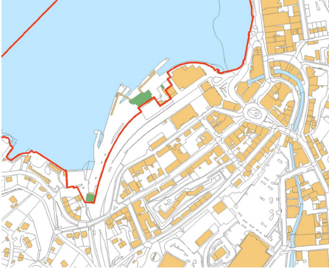
Inset Plan 2

Changes to legislation: There are currently no known outstanding effects for the The Port Security (Port of Oban) Designation Order 2015. (See end of Document for details)