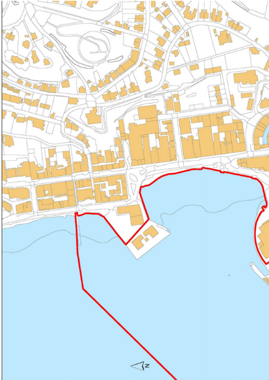
Inset Plan 3

Changes to legislation: There are currently no known outstanding effects for the The Port Security (Port of Oban) Designation Order 2015. (See end of Document for details)