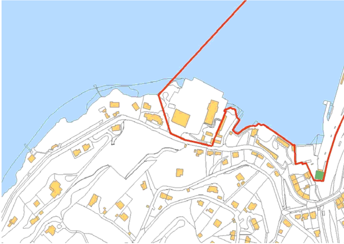
Inset Plan 1